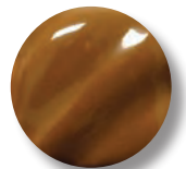
HF-133 Deco Brown