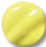
HF-161 Bright Yellow