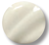
HF-9 Zinc-Free Clear