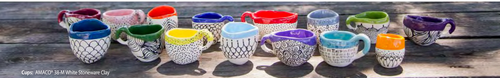
Cups: AMACO® 38-M White Stoneware Clay