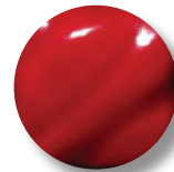
HF-56 Red Gloss