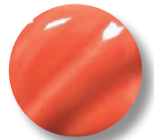
HF-55 Coral Gloss