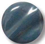
HF-120 Dark Blue