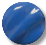
HF-127 China Blue