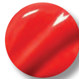
HF-165 Scarlet Red