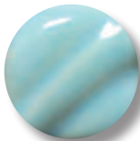
HF-129 Baby Blue