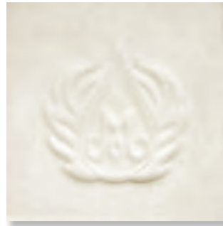
SW-002 Matte Clear

SW-001 Stoneware Clear adds a brilliant clear, smooth gloss finish to your work. Apply to soft-fired bisque (cone 04-06) and fire to cone 5/6 or up to cone 10. Can also be applied to dry greenware for single firing.