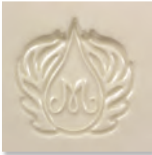
SW-001 Stoneware Clear

SW-001 Stoneware Clear adds a brilliant clear, smooth gloss finish to your work. Apply to soft-fired bisque (cone 04-06) and fire to cone 5/6 or up to cone 10. Can also be applied to dry greenware for single firing.