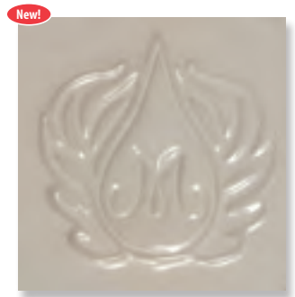
SW-004 Zinc-Free Clear

SW-003 Crackle Matte Clear is developed for mid-range firing temperatures where a fine crackle pattern will develop with 3 coats. Fire to cone 5/6. Crackle pattern may not develop at higher cone 9/10 temperatures.