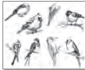
DSS-0108 Aviary - Small Birds Seen on sample to left.

AC-310 Silkscreen Medium is a thickening agent to be mixed with Underglazes, Stroke & Coats®, Stoneware Washes, Softees™ Acrylics, fabric paints and more to make a paste. At the appropriate consistency, this paste produces very fine details when using Designer Silkscreens on ceramics, glass, paper, wood and other craft surfaces. Certified AP Non-Toxic. Available in 4oz jar.